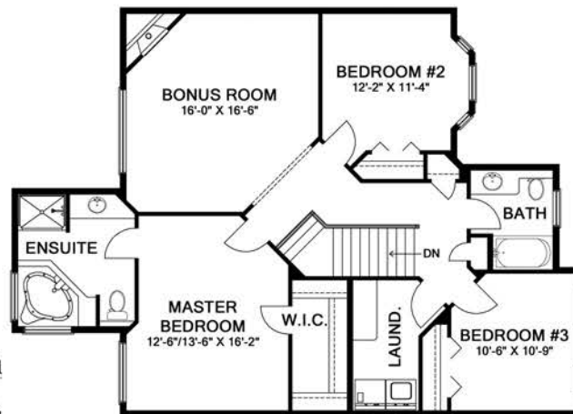
Second Floor Plan 1230 sq. ft.

In our continuing effort to improve design and specifications, the builder reserves the right to make additions or deletions. To confirm actual dimensions and installation, check with the sales consultant.